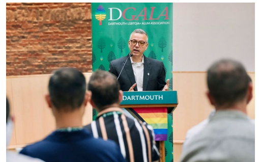
Dartmouth's new (openly gay) Health & Wellness Officer addresses the meeting

President purchased and then immediately donned one of our fabulous new rainbow Dartmouth t-shirts at the event. We sold out of those shirts at the breakfast and the midday reception of all the Alum Affiliated Groups, but we hope to have more in 2025. Although we have the DGALA40 all-class reunion weekend coming up in July, plans also are afoot to keep the traditional June events going as well, so stay tuned for details on that.❖