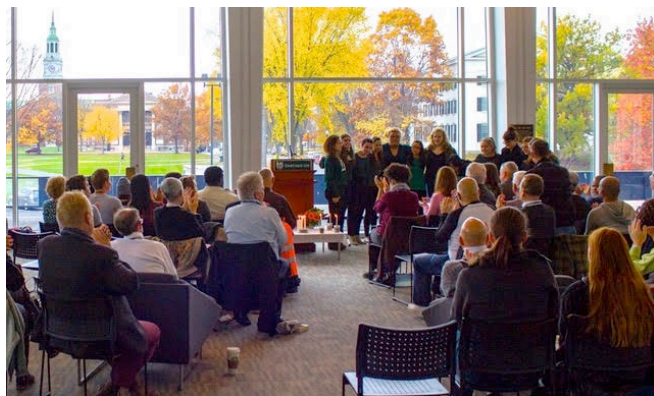
Rockapellas Perform at 2014 All-Class Reunion

DGALA's next All-Class Reunion has officially been booked on campus for the first weekend in October of next year: from Friday, October 4 through Sunday October 6, 2019. This reunion will be extra special, as it celebrates DGALA's 45 th anniversary and corresponds with the College's 250 th anniversary. Save the date! ❖