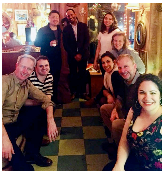
DGALA NY took a tour of the "No One Exists Alone: Queer Belonging" exhibition at The Whitney – featuring American art exploring gender, sexuality, and LGBTQ perspectives. Afterwards they gathered at the Rusty Knot in the West Village.