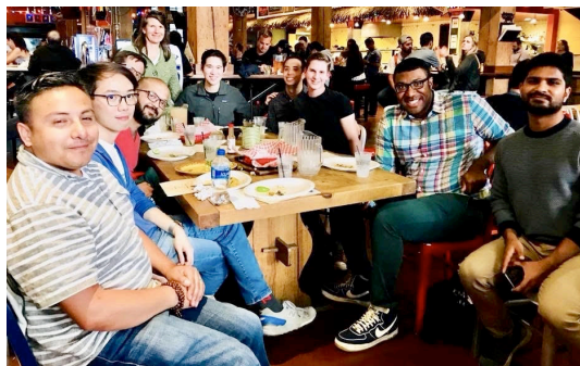
Fun Wednesday Happy Hour in downtown San Francisco, fueled by a lot of margaritas and nachos