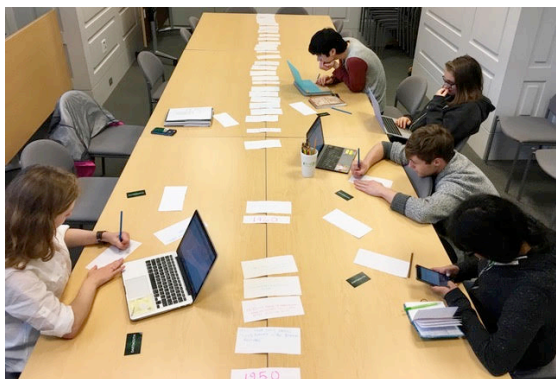
During Training, SpeakOut Student Interviewers Do Research and Make Timeline of Recent LGBTQ History

After several years of planning, SpeakOut, the DGALA-initiated oral history project for Dartmouth's LGBTQIA+ community, launched in April 2018 with its first 10 student interviewers. The student interviews were selected by representatives from both DGALA and Rauner Special Collections Library through a competitive application process during the winter 2018 term, and upon