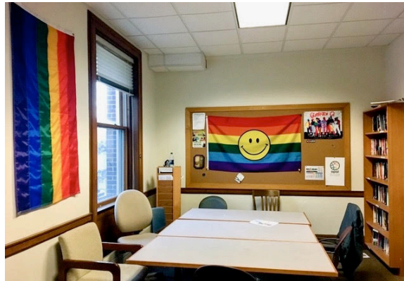
Rainbow Room Today

The physical space of the Rainbow Room will remain called the Rainbow Room. It will include resources for LGBTQIA+ students and adornments celebrating the LGBTQIA+ community. We will work with DGALA on creating a commemorative display for the room to honor the legacy of the space and LGBTQIA+ life at Dartmouth. It will have blocked hours from 10pm to 8am to continue to serve as an LGBTQIA-centered space, and it will become reservable only between the hours of 8am to 10pm. These changes are an evolution of our work with and for LGBTQIA+ students. In the upcoming months, OPAL Dean Sebastián Muñoz-Medina will launch an audit of campus resources for LGBTQIA+ students (which will include student participation and input). We look forward to partnering with DGALA in this endeavor."