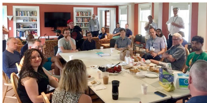
Last Year's Mini-Reunion Brunch at Triangle House

DGALA will hold its annual mini-reunion on campus during the weekend of Friday, June 15 through Sunday June 17. All events are free (no registration required) and open to DGALA members, friends, family and allies. Both the Saturday breakfast and Sunday brunch and tour at Triangle House are family-friendly, and the Saturday afternoon talk will have more about SpeakOut. Full schedule below.