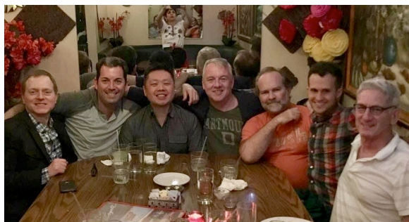
DGALA LA gathers at El Coyote Mexican Restaurant in Los Angeles