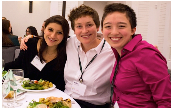
Fun at the Gala Dinner

Periodically throughout the meal, guests were encouraged to make commemorative toasts; many were given, and this proved to be a particularly moving part of