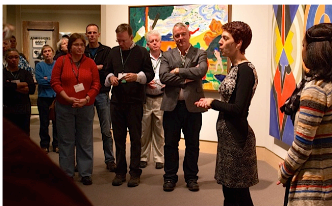
Touring the Hood's Civil Rights Exhibition

After the Triangle House ceremony, afternoon programming got underway with the Featured