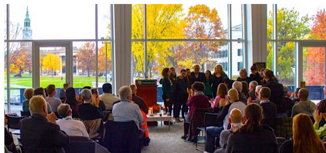
Rockapellas at the Top of the Hop Celebration