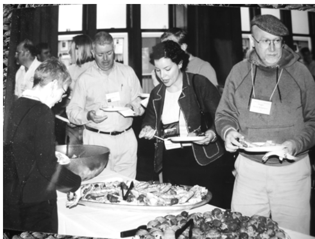
Left: Candlelight Ceremony at Remembrance Ceremony Above: Yummy Food at Sunday Brunch!